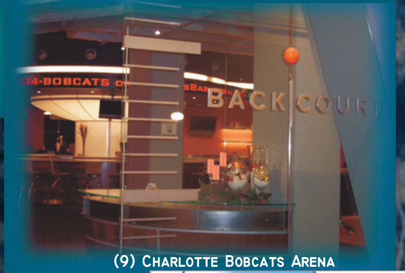
(9) CHARLOTTE BOBCATS ARENA

Phone: (919) 877-8557 Fax: (919) 877-8558 Website: newIZON.com