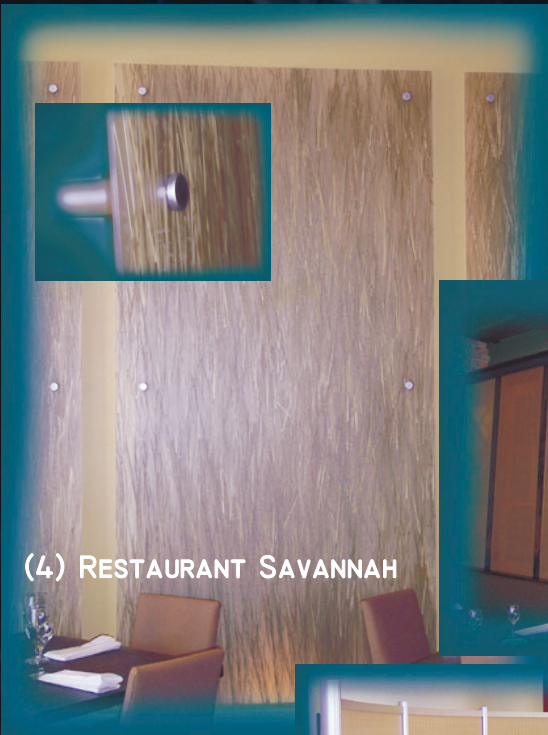
(4) RESTAURANT SAVANNAH