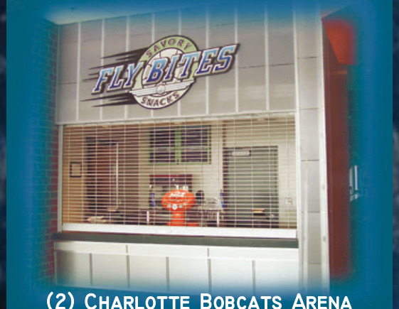
(2) CHARLOTTE BOBCATS ARENA