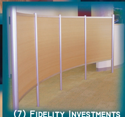
(7) FIDELITY INVESTMENTS