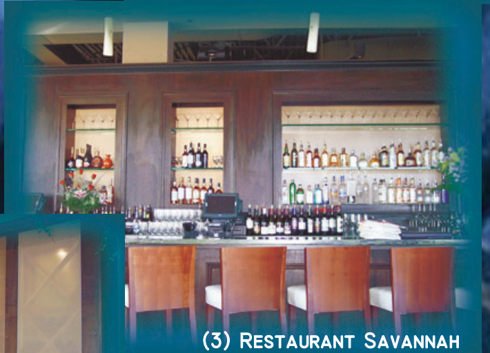
(3) RESTAURANT SAVANNAH