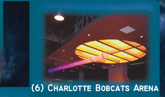
(6) CHARLOTTE BOBCATS ARENA