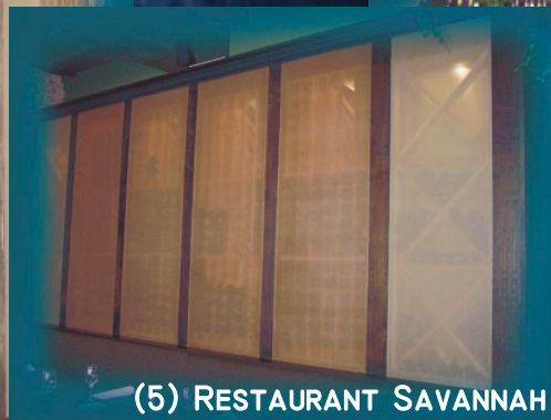
(5) RESTAURANT SAVANNAH